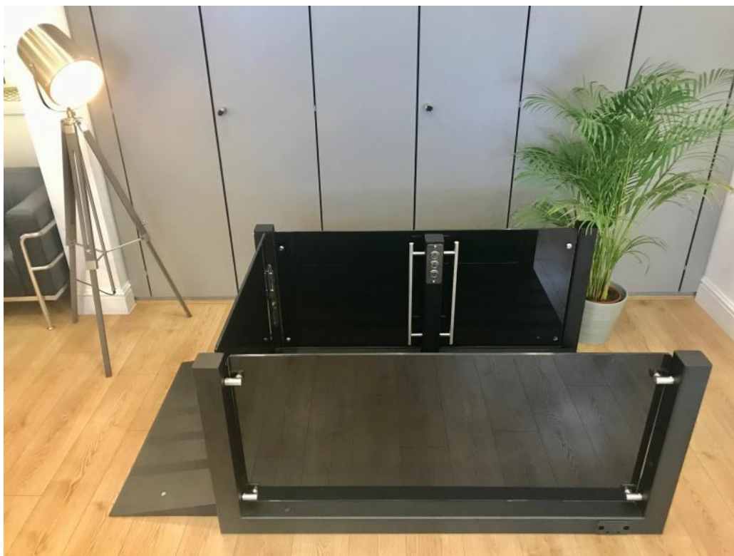
Huge choice of side panel colours and materials including clear and coloured glass