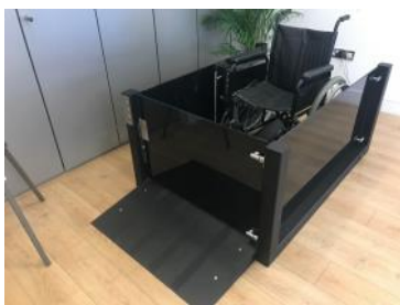
Easy access ramp and interlocked gate

ICE Collection low rise step lifts are compact and very easy to install with a minimum of preparation. ICE step lifts are designed and manufactured at the Lyfthaus Technology Centre near Cambridge, England.